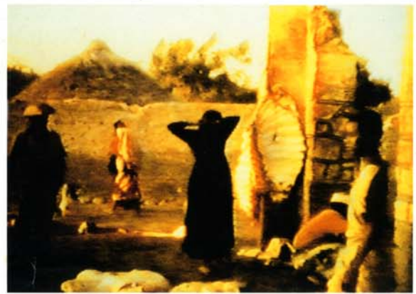
Stretching Woman (abattoir)